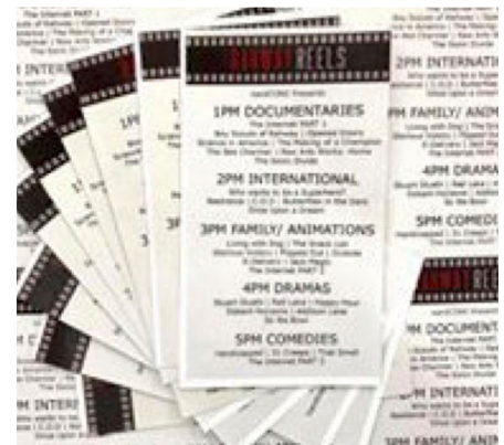
The Rahway Reel Short Film Festival was part of Culture Crawl