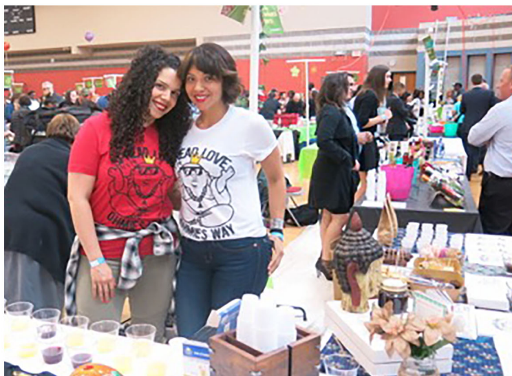
At the Taste of Spring, Vendors enjoy the opportunity to show off their goodies