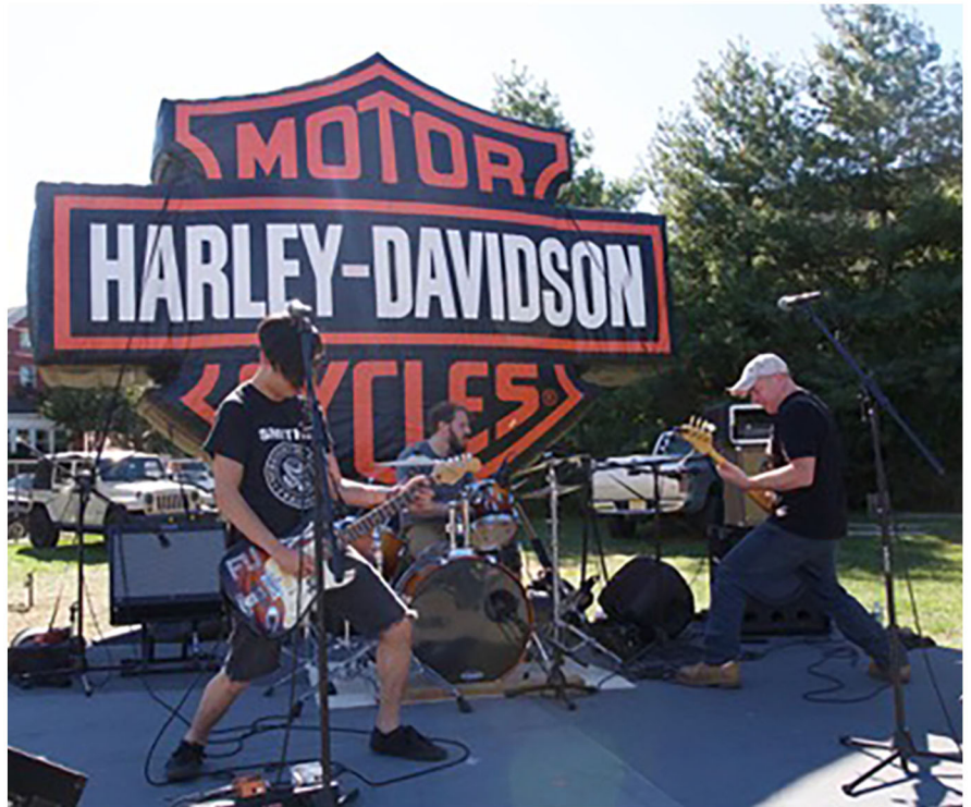
The Hannum's Harley-Davidson music stage, one of three main stage performing venues