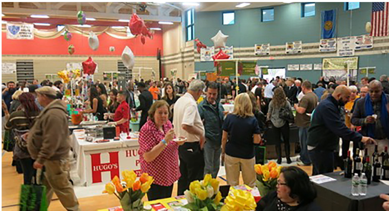
A full house at the Rahway Taste of Spring 2017

The Taste has come a long way since the very first Taste of Rahway was held in the Masonic Hall in the fall of 2000, and attracted 100 visitors to sample the best of a dozen Rahway restaurants. Within a few years, The Taste had grown so popular that it filled the entire gym at the Recreation Center, and needed additional tents to accommodate more than 1,000 "Tasters." Over the years, the hard work of a dedicated Taste Committee crew has made this event possible, and made each Taste better than the year before!