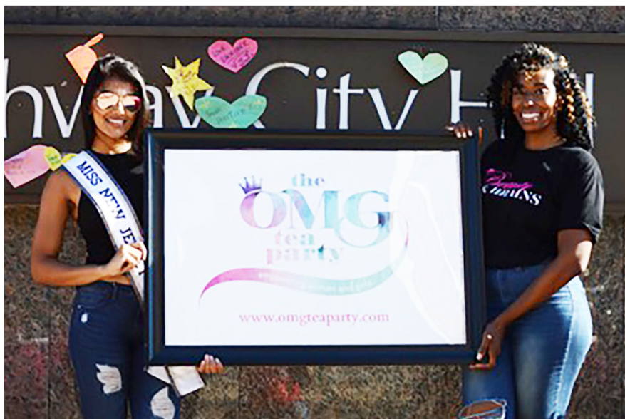
OMG Creation Station at City Hall Plaza

responses from last year's Culture Crawl inspired the RABP to schedule this year's event on Saturday afternoon, rather than Friday night, to extend the duration to five hours, rather than three hours as in previous years, to expand the footprint of Culture Crawl, and to increase the number of participating artists.