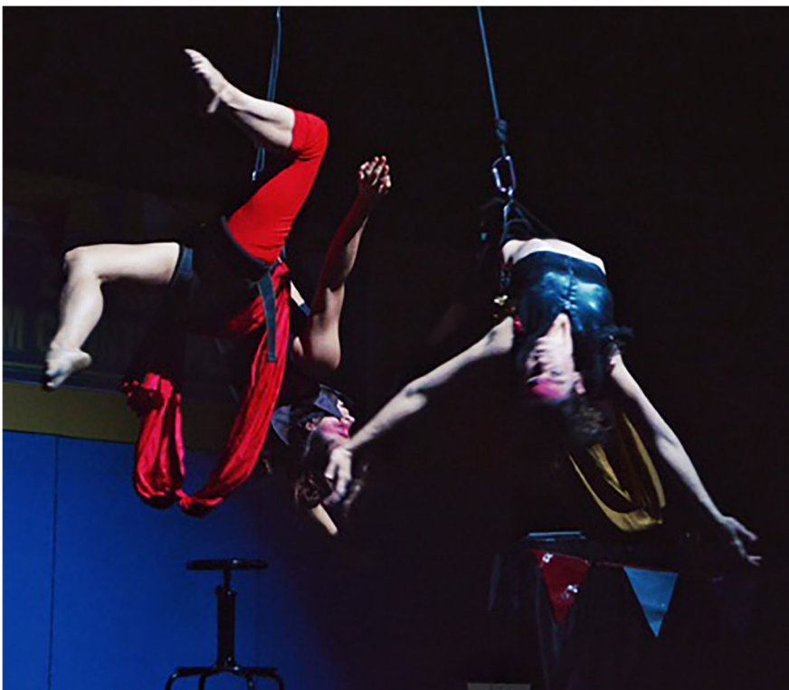
Grounded Aerial performing at Hamilton Stage