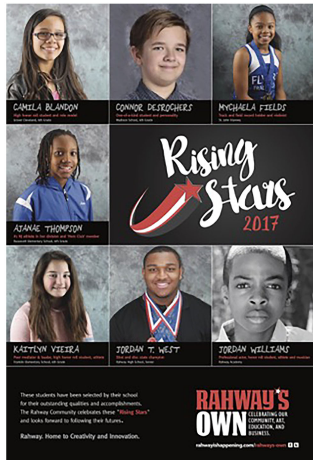
The poster celebrating the first class of Rahway's Own Rising Stars

The Rahway's Own and the Rising Star posters can be seen on the walls of Rahway High School, as well as under the clocktower at Rahway Train Station Plaza. The posters were also displayed at Menlo Park Mall. A mobile version of the posters, on display at the Cherry Pit building on Cherry Street, is presented at school concerts, the Taste of Spring and anywhere the RABP is able to display our pride in Rahway's rich history as a launching pad for creativity and innovation.